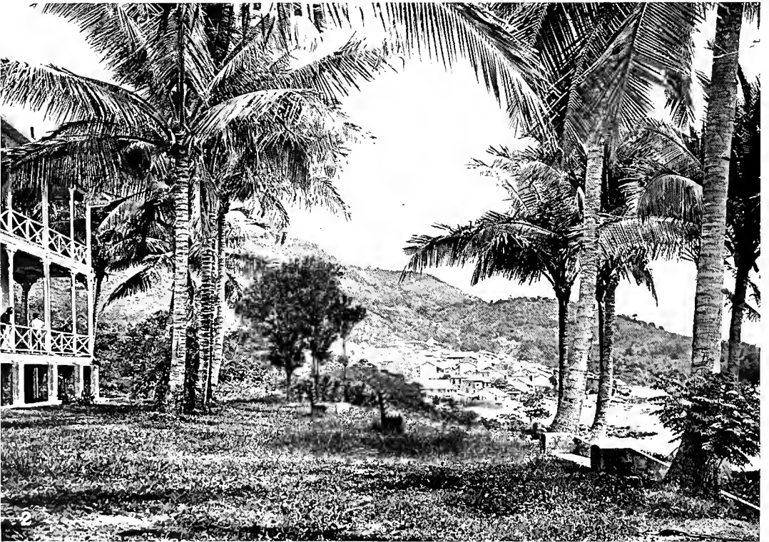
1. Gorgona as it was during construction days ; today its site is under water. 2. View from grounds of Taboga Island Sanitarium, where American invalids were sent to recuperate.