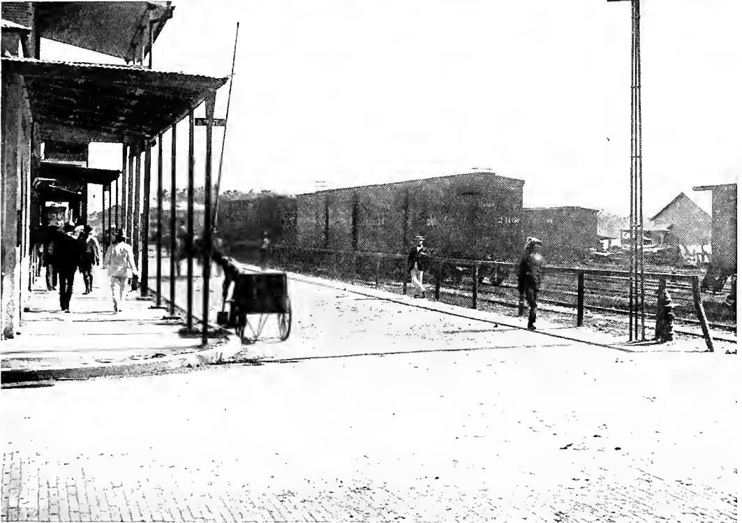
Eighth and Front Streets in Colon, before and after the Americans cleaned up the city and furnished it with water, sewers and paved streets.