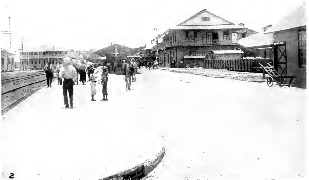
2 The Cristobal commissary neighborhood before and after the sanitary work of 1906-1907.